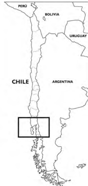
Figure 1. The 13 communes in the provinces of Llanquihue and Palena, southern Chile. (Two communes share the name of the province to which they belong.) Asterisk indicates Andean communes. Inset: South America, with study area in box.

arterial oxygen tension/inspiratory oxygen fraction (PAFI) index, steroid administration, mechanical ventilation (MV) (specifying timing of connection), and circulatory shock. Shock was defined as systolic blood pressure <90 mm Hg that did not improve with fluid administration or that required the use of vasoactive drugs and abnormalities in tissue perfusion manifested by alteration of consciousness, oliguria, and lactate acidosis (5). One of the authors (R.R.) analyzed chest radiographs and classified the infiltrates as alveolar, interstitial, or mixed pattern and unilateral or bilateral; number of compromised quadrants and presence of pleural effusion were recorded. Results of laboratory tests performed on admission and during illness were also recorded. Each case was classified into 1 of 3 groups: grade I (mild disease) when patients had only