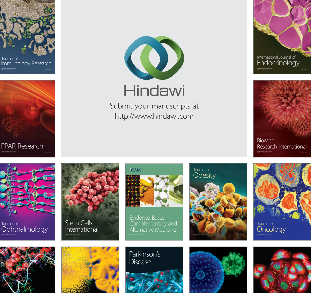
Oxidative Medicine and Cellular Longevity